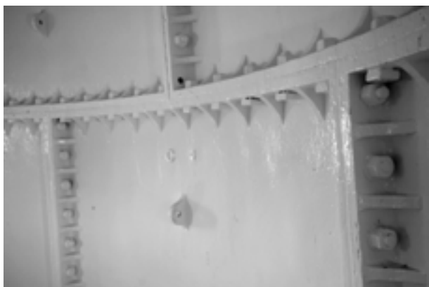
Figure 2. The cast iron plates of the Bustard Head lighthouse tower

The two cast iron lighthouses were erected by private building contractors under the supervision of officers of the Department of Public Works and with the advice of the Portmaster. The contractors also built timber houses for the light keepers. Erecting the iron lighthouses was quick, but getting the lighthouse components and other materials to the sites and preparing concrete bases beforehand took many months. The departmental staff and the contractors learned some useful lessons about the best ways to organise the works – lessons they would later apply to other lighthouse projects.