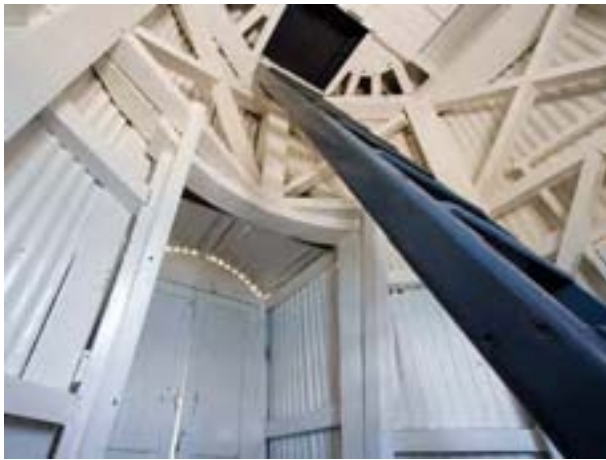
Figure 6. Interior of Goods Island lighthouse

at Goods Island in the Torres Strait. The timber framework had heavy timber cross bracing, but was otherwise similar to the iron plated type. The sheeting was specially formed with tapering corrugations to suit the conical shape of the tower.