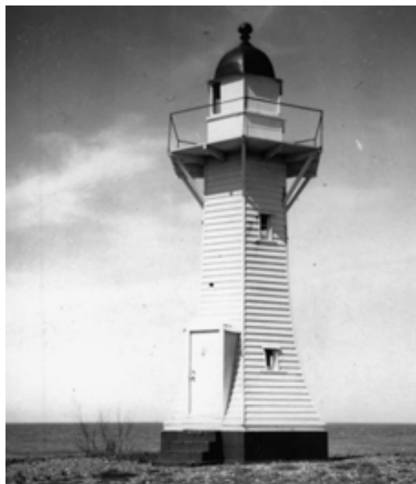
Figure 3. Burnett Heads lighthouse

precedents for such forms, and there may have been American influences on the Queensland designs too. While Blackett was refining the design of timber lighthouse towers to improve stiffness, wind resistance and durability, the Queensland designers were finding different ways to deal with these problems.