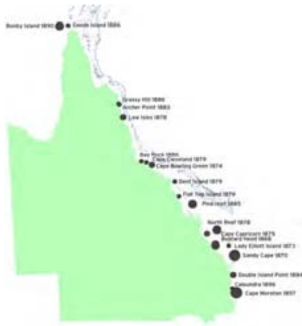
Figure 1. Queensland coastal lighthouses before 1900

From the establishment of the colony of Queensland in 1859 until the separate colonies federated to form the Commonwealth of Australia in 1901 engineers and architects designed an impressive set of lighthouses. The Queenslanders developed a type of timber framed, iron plated lighthouse tower which is a local Queensland invention. It turned out to be a technical and economic success, though the idea was not taken up elsewhere.